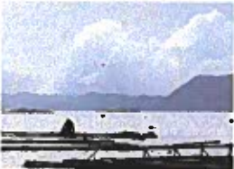
LIFE CONTINUES: A man catches fish as the Taal Volcano erupts in the background in Talisay, Batangas, Philippines, Jan. 15.