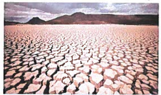
DROUGHT: Clouds gather but produce no rain as cracks are seen in the dried up municipal dam in drought-struck Graff-Reiner in South Africa, Nov. 14, 2019.

the 20th-century average of 57 degrees Fahrenheit, according to NOAA's measurements.