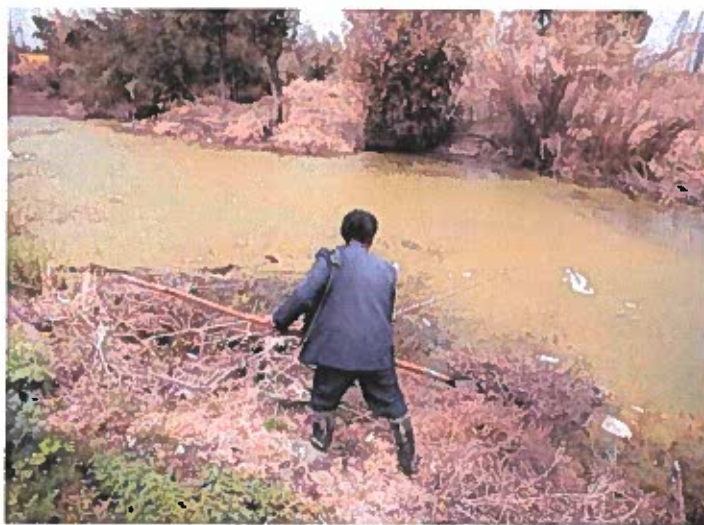
UNHEALTHY: A farmer works on a polluted river in Shanghai, China, March 21, 2016.

it calls "ecological protection red lines" that make areas off-limits to agriculture and industry. But with water demand still on the rise, it