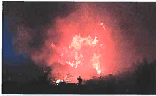
WILDFIRES: A firefighter tries to extinguish a fire as a wildfire burns near the village of Gavallas, in Evia, Greece, July 6, 2019.

In 2019, the average global surface temperature was 1.7 degrees above